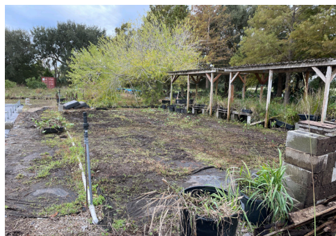
The area around the pergola, previously very weedy, cleaned and ready for landscape fabric.