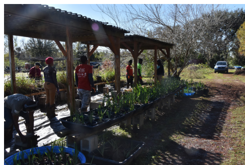
Workers from Limitless Vistas, a non-profit group that has helped us over the years and that has stepped up in recent weeks to do major work.