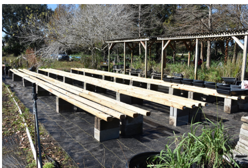
The space around the pergola with landscape fabric in place and new stands for iris trays waiting for plants